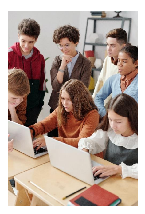
Top of the Document